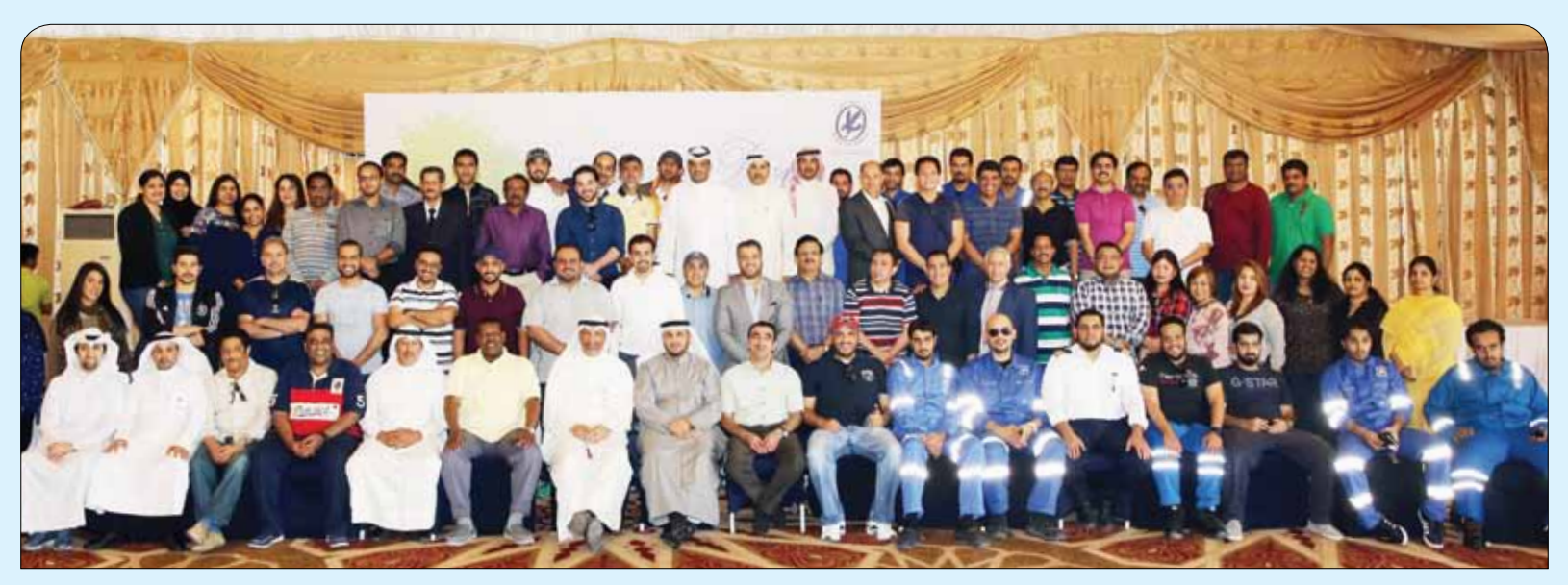
Security & HSE Groups