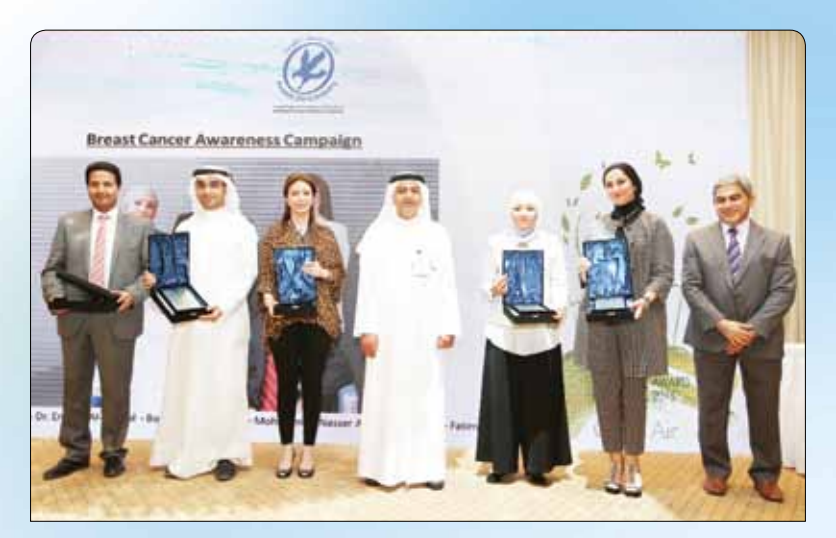
Al-Rabs alu trunt - Ara